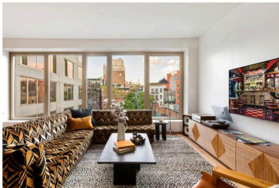
The living room in the model unit that Kravitz Design recently completed at 75 Kenmare features a vintage Milo Baughman sofa.

I cover residential real estate, including buying, selling and trends.