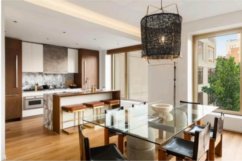
The open-plan kitchen showcases white oak cabinetry and Gaggenau appliances.

Drawing inspiration from an eclectic downtown vibe, Kravitz Design integrates natural stones, bonded metal and aged oak throughout the building.